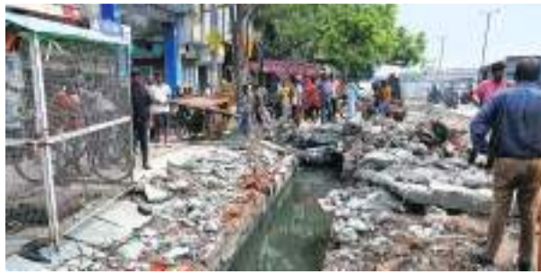
The woman and her three-year-old son drowned in the open drain in East Delhi, on July 31.